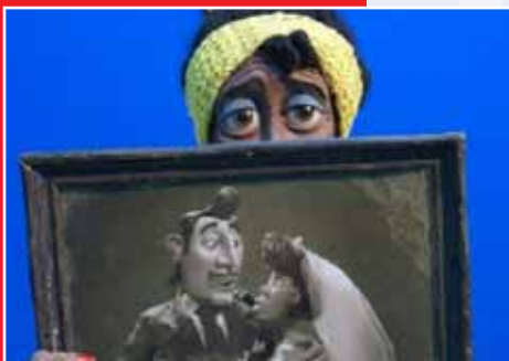
Veinte Años (Twenty Years)