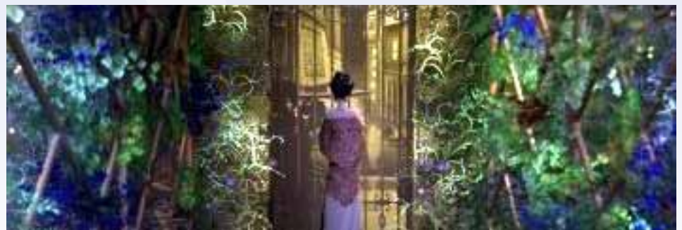
La Luna en el Jardin (The Moon in the Garden)