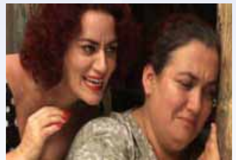
El Premio Flaco