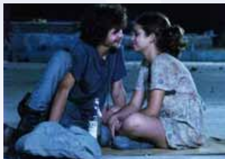
Boletto al Paraiso (Ticket to Paradise)